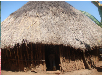
His worn out house