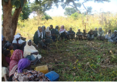
CC Session Being Conducted at Sekoru

As per the proposal and agreement, Community (Clan) Leaders, Religious Leaders, and CBO Leaders were selected from the community and trained on the basic knowledge, skills and practices of Community Conversation (CC) as CC Facilitators. The community has identified issues of OVC and HIV/AIDS as major concerns during community conversation sessions. As a result, they have developed action plan (that had not been considered as a requirement within the project proposal) to sponsor at least additional 4 OVC per site and carry out other major problems of the community. EMRDA has prepared by law to the CC groups to manage and govern the session which is instrumental to sustain the group as organized institution to benefit the members and the OVC and PLHA